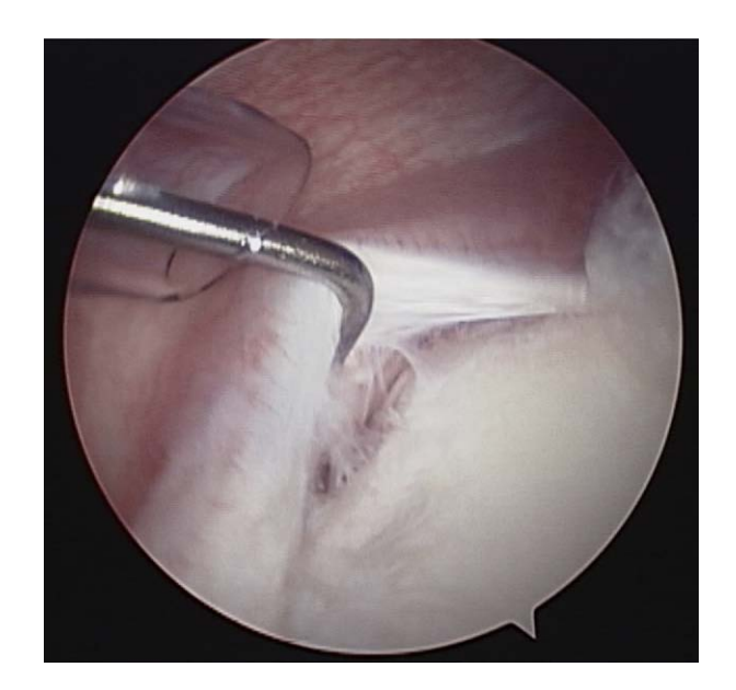
FIGURE 1. A systematic 15-point glenohumeral arthroscopy shows a typical posterior labral tear.

After general anesthesia, the patient is placed in the lateral decubitus position and secured with a bean bag. An EUA is performed to assess the direction and degree of instability. After sterile preparation, the arm is placed in a padded sleeve with approximately 10 lb of in-line traction for glenohumeral suspension. A standard posterior portal is made, and the glenohumeral joint is entered. An anterosuperior portal is created by an outside-in technique. A systematic and routine 15-point examination of the shoulder is performed with visualization posteriorly and anteriorly. The presence of the posterior Bankart lesion is confirmed (Fig 1), and redundancy of the anterior and posterior capsule is